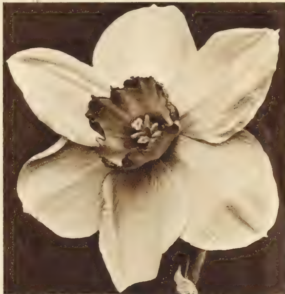
THE INCOMPARABLE DAFFODILS

The numbers following the names indicate their relative earliness; (1) 1st early, (2) 2nd early, (3) mid-season, (4) late, (5) very late.